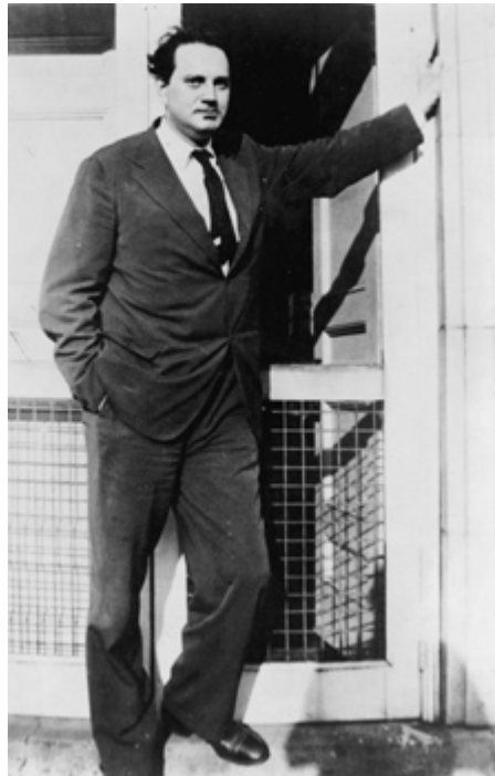
Left: Thomas Wolfe